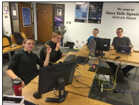
HIGH SCHOOL TEAM2