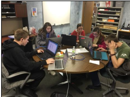
HIGH SCHOOL TEAM1