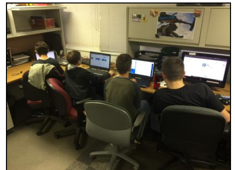
MIDDLE SCHOOL TEAM